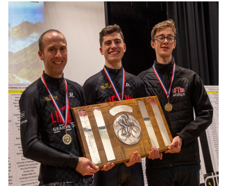
Men Team Team Lifting Gear Products