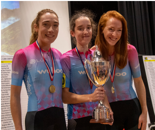
Women Team Wahoo Endurance Zone p/b Le Col